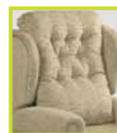
Button back