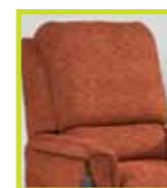
Firm back