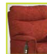
Soft back